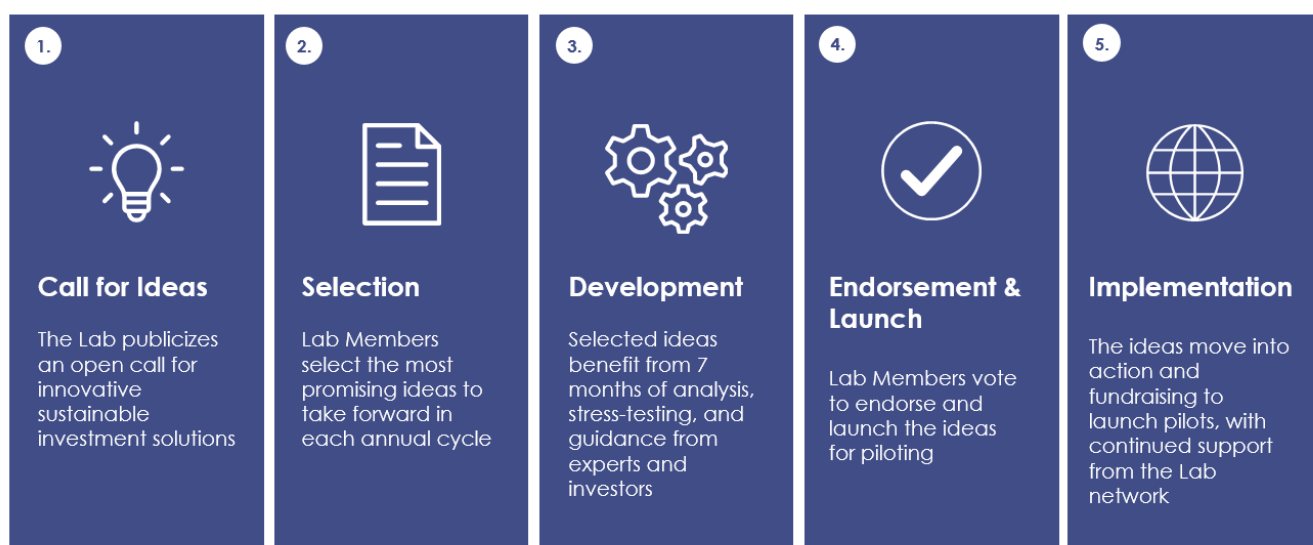
Figure 2: An Overview of the Lab Process

A complete Lab Cycle operates over the course of a 12-month period (see Figure 2). Lab Members are convened throughout the cycle to fine-tune as well as challenge the selected ideas. The Lab's 2023 Cycle will run from October 2022 to October 2023, with the majority of the analytical work concluding in August 2023. This 12-month cycle includes three distinct analytical phases, concluded with endorsement: Phase 1 (Call for Ideas and Selection); Phase 2 (Instrument Design); Phase 3 (Implementation Pathway and Impact).